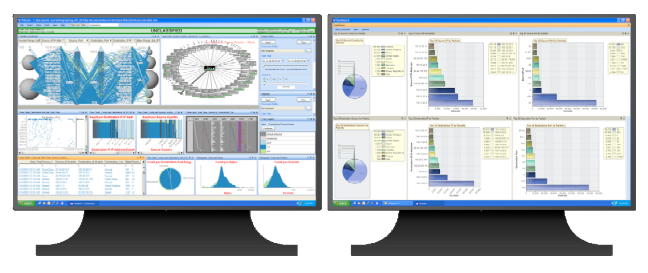
Figure 1. VIAssist visual analytics platform.

The design of the system, VIAssist, was informed by a Cognitive Task Analysis of CND analysts in commercial and military environments. [3] The results of this research formed the use cases and informs the design of VIAssist; for example, motivating the collaborative and reporting functionality that differentiate the system from other network flow visualization systems.